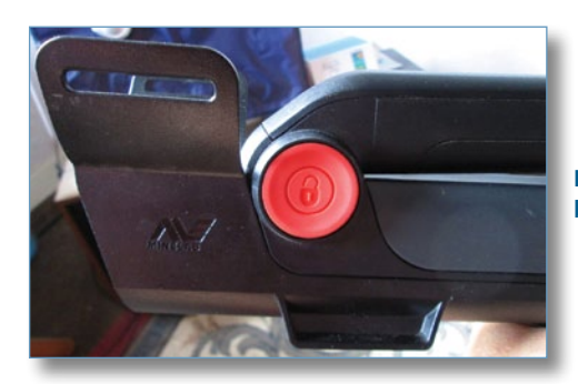
Handle lock button.

This is a small bar gauge consisting of three inverted bars. When you receive a target one of the