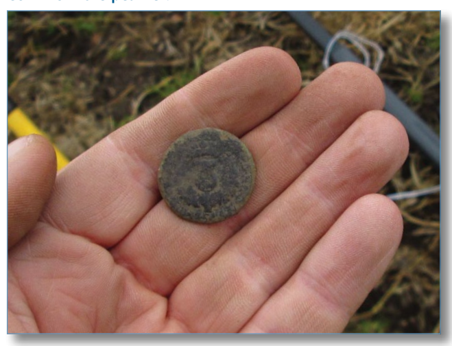
Coin from the pea field.