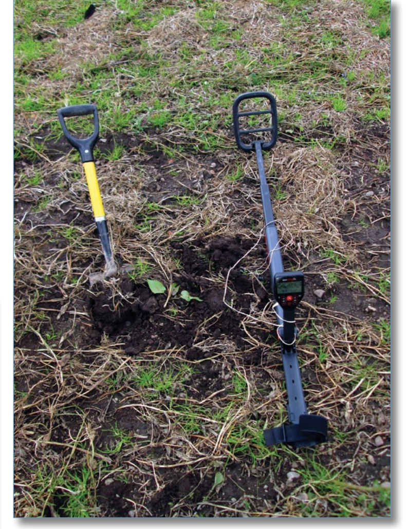
The pea field.