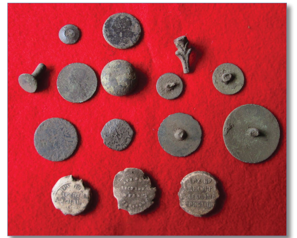
Finds from the pea field.