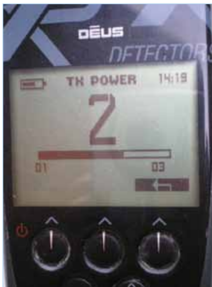
Screen in TX.

The manual states that "This section covers the advanced settings. You should ensure that you have studied all the basic parameters before moving on to this section". Believe me the manufacturers of XP are not kidding!