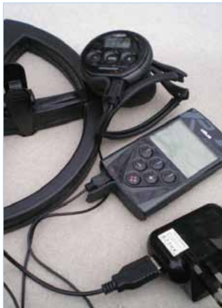
Charging the units.

When both shafts are fully retracted for easy carrying purposes, the whole detector reduces to just 2 feet 2 inches; less than the length of an average foot assisted trowel! Now ally that to the fact that the Déus weighs in at just 875 grams making it just about the lightest detector (serious ones, not toys!) on the market today.