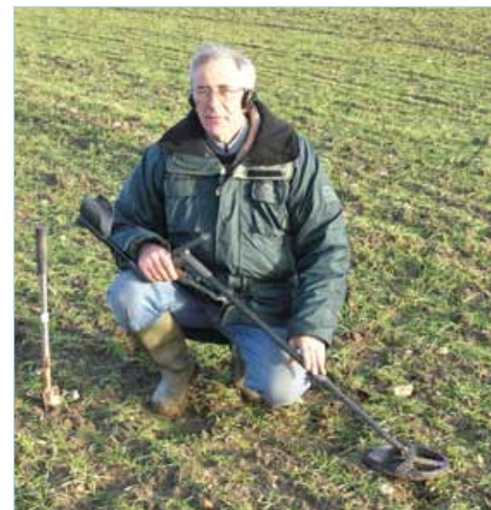
The author with the Deus on a cold day.

What do you think takes up the most space and is also the major weight factor in a control box? Yes, of course, the batteries. The accepted norm has been 12 volts and in the past it has been necessary not only for the power output, but also for the longevity of detecting hours. However, with technological strides made recently, would it be possible to use very compact, high-capacity lithium batteries? Yes, with an ultra miniature electronic circuitry. So now the remote, the coil and the headphones have their own identical power source. But how long will the batteries last? In the past it has generally been the practice of having to charge the batteries for at least an overnight period of time. Not looking so good? No, each of the three elements can also be charged separately if required. Another feature of lithium polymer batteries is that they can be quickly charged without developing a memory. Charging time for the remote and headphones is 2 hours when completely flat, the coil is just 90 minutes. Looking good, but how long do they last? Between 9 and 10