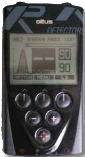
Remote with LCD activated.

The remote control also has its own black leather and clear plastic case for belt-mounting with its innovative "flop down" magnetic flap to view the readings on the LCD screen. (For when it's raining?) Otherwise, without its case, the remote control "sticks" on the magnetic head of the top shaft. (It will soon be available with Velcro straps so as to be able to be worn on the sleeve or arm).