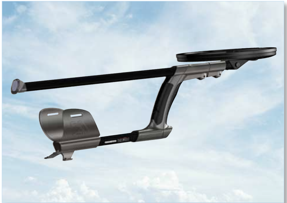
Déus “Starship Enterprise”.

This definitely isn't one of those machines that have been rehashed using existing technology, quickly produced