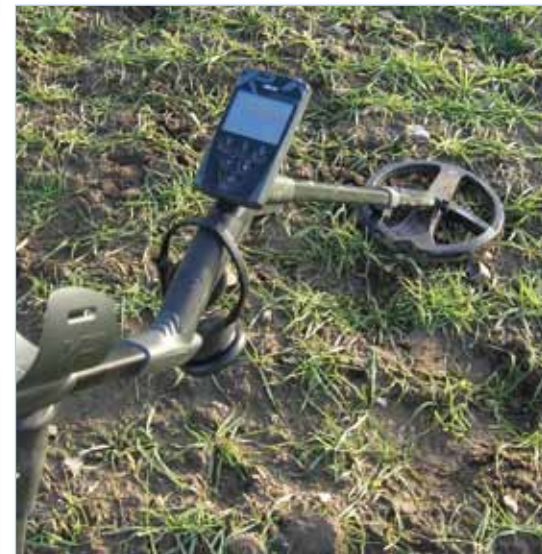
Remote control on magnetic head of shaft.

Think about that for a minute, a battery, and electronic circuitry in the coil?