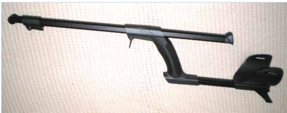
Handgrip/arm-cup, cam-locks, and shafts.

The length of the lower shaft is determined by the use of the lower cam-lock, it is adjustable in millimetre increments to ensure maximum comfort when detecting. Changing different coils in the future will be a doddle. The upper shaft and cam-lock is an integral part of the handgrip/three position arm-cup support, and when the shaft is fully extended, the sculpted magnet (for attaching the remote control) on the end of the shaft butts up to the handgrip.