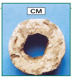
Fig.7. Lead spindle whorl or loom weight.