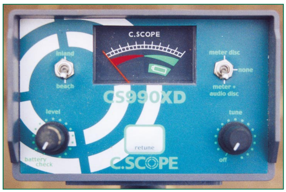
Fig.2. The CS990XD's control panel.

The CS990XD's discrimination level is centred at about that of wet salt sand but can be varied from iron reject through to aluminium reject by adjusting the Level control, which is situated on the lower left of the control panel. This control also adjusts the "exclude" point of Meter Disc, and Meter & Audio Disc.