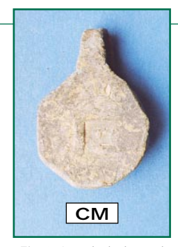
Fig.8. Lead cloth seal.

other target: a lead cloth seal (Fig.8.). After that my fingers were too numb to continue so it was back to the car.