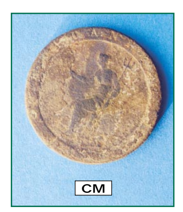
Fig.3. George III cartwheel penny.